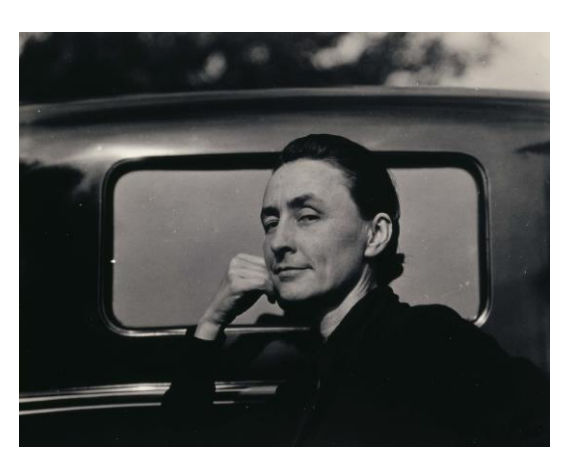
Georgia O'Keeffe–After Return from New Mexico, 1929 Alfred Stieglitz