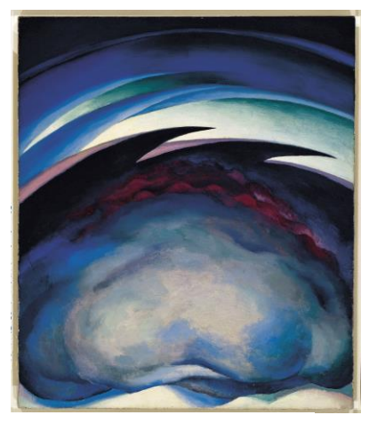
Series I - From the Plains, 1919 Georgia O'Keeffe

Georgia O'Keeffe is one of America's most influential artists, known for her groundbreaking use of abstraction, dramatically modern compositions and exquisite sense for the beauty of the natural world. Her mediums of choice included: charcoal, pastel, watercolor, and oil paint, however she never settled easily into a set convention or habit, determining the size and medium anew with each painting. O'Keeffe also left very little to chance in her creative process. She was almost never impulsive, meticulously planning her composition and applying paint to the canvas with careful precision. This exacting control can be seen in the way she carefully shaped and shaved the tips of many of her paint brushes found in her studio.