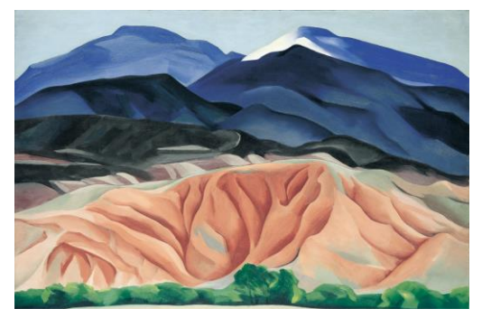
Black Mesa Landscape, New Mexico / Out Back of Marie's II, 1930 Georgia O'Keeffe