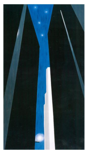
Untitled (City Night), 1970s Georgia O'Keeffe

What is abstraction? Abstraction is a word used to describe an image that is no longer recognizable as a person, place or thing, but instead might express an emotion or sensation through the use of color and form. Abstract artists simplify, generalize, distort and rearrange what they see or perceive in the real world. Objects and places are distilled to their most basic elements. O'Keeffe was one of the first American artists to make abstract art. She sought to communicate the essence of an experience so that the viewer would feel as she felt and see as she saw.