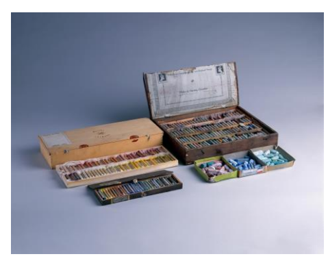
Georgia O'Keeffe artist materials, 2001