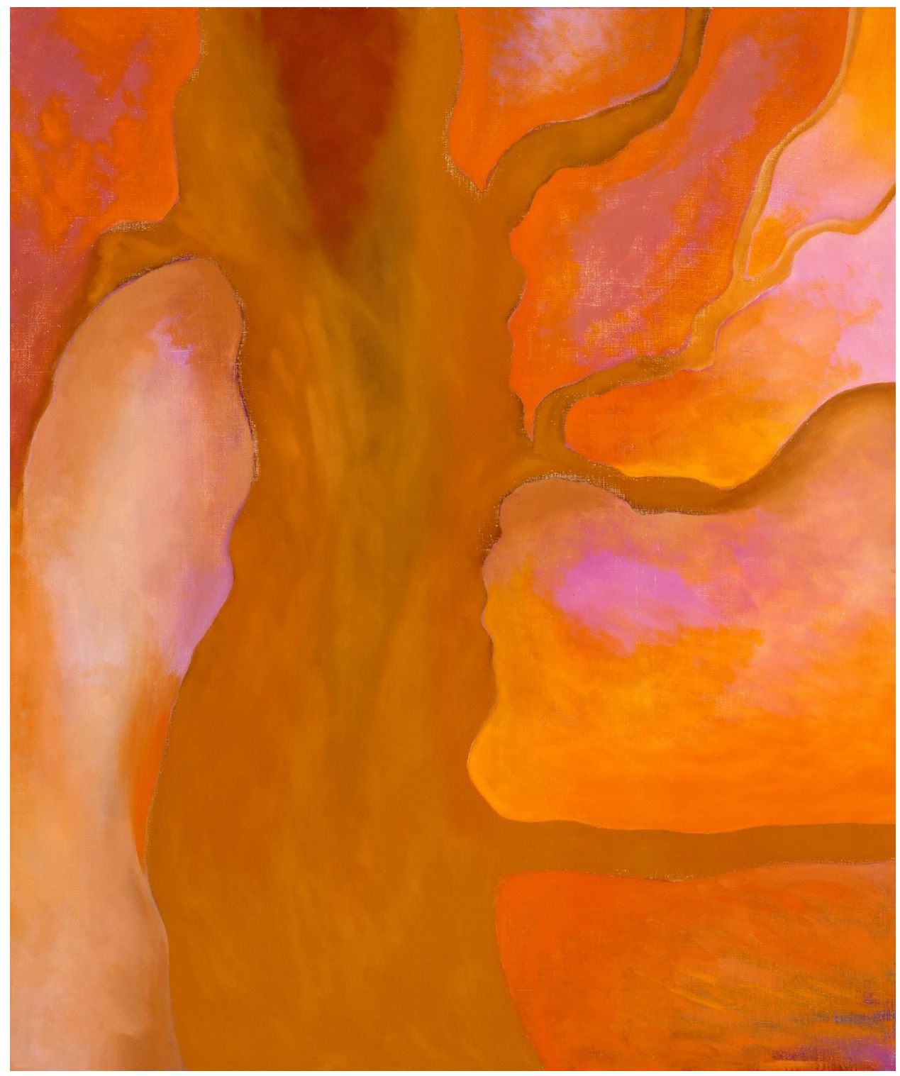
Tan, Orange, Yellow, Lavender, 1959/1960 Georgia O'Keeffe Oil on Canvas